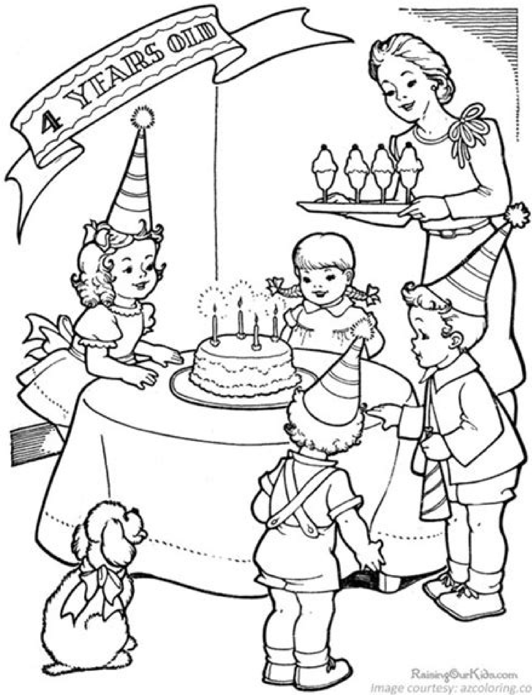
RaisingOurKids.com Image courtesy: azcoloring.com